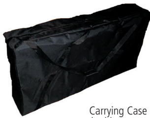
Carrying Case *sold separate